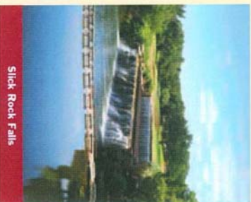
Slick Rock Falls