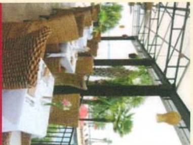
The Yacht Club

Accommodation choices include the Horseshoe Bay Resort Marriott with 385 guestrooms and suites, including