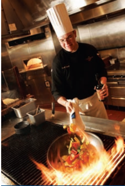
Catch all the fiery action of Hill Country cuisine at Lantana's open kitchen.

Outdoor dining is outstanding at the newly-renovated Cap Rock Grill & Bar . On the side facing the driving range is a flagstone patio punctuated by a waterfall pool and the Cap Rock outcropping. A two-tiered